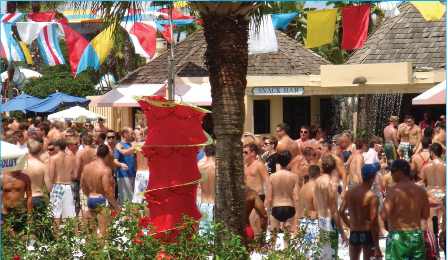
Pool Party at Gay Days, one of Orlando's premier gay & lesbian events

Home of Disneyworld , SeaWorld Orlando and Universal Studios , Orlando welcomes the arrival of thousands of tourists daily. However, Orlando isn't just for kids and families. The theme park capital of America has plenty to offer adults and the GLBT community. Orlando is home to the oldest gay community center in Florida and one of the nation's most popular gay events. With a two-decade tradition, Gay Days has evolved from a one-day affair into a week long celebration attracting over 100,000 revelers to dozens of events citywide. Attendees enjoy world-class nightlife and pool parties all hosted by the hottest DJs at many of the city's best venues.